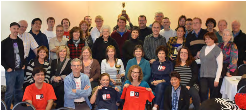
2011 Kingston Cup Tournament Participants