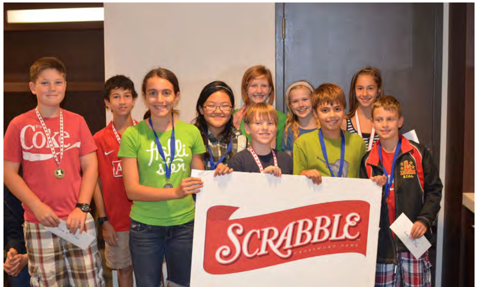
Winners of the Fall Word Fest, the inaugural event of the 2011-2012 Toronto School SCRABBLE season, posing with their medals and prizes