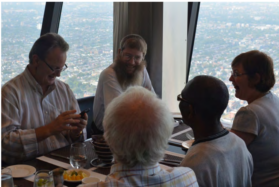
The top players in Toronto, dining over 350 metres above ground level.

We have also extended fine-grain profile information access controls to extend to birthdates. As with other personal information, it is not shared with the public, and you can grant permission to share it with directors, players or vendors. (We keep track of birthdates so that we can offer age or birthday-related promotions, more easily tell apart people with similar names, and identify our members to the media in the customary "name, age, occupation" style.)