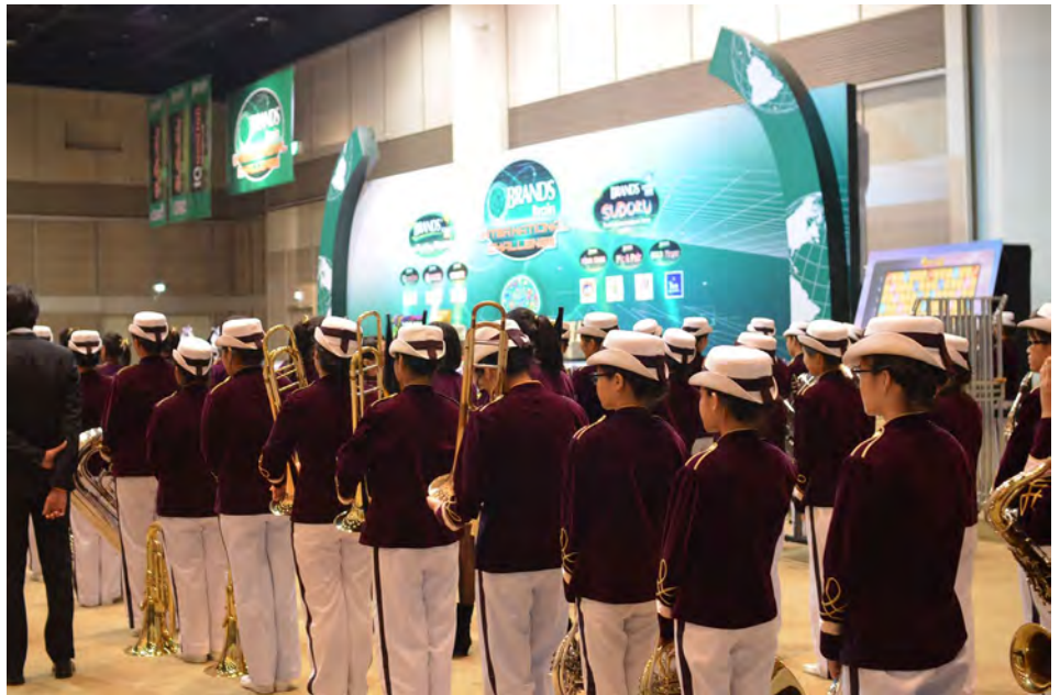
The marching band warming up to welcome the King's Cup royal sponsor

Come visit the Zyzyva table at the National SCRABBLE Championship next month in Dallas for Zyzyva T-shirts, lapel pins, tile bags and tiles!