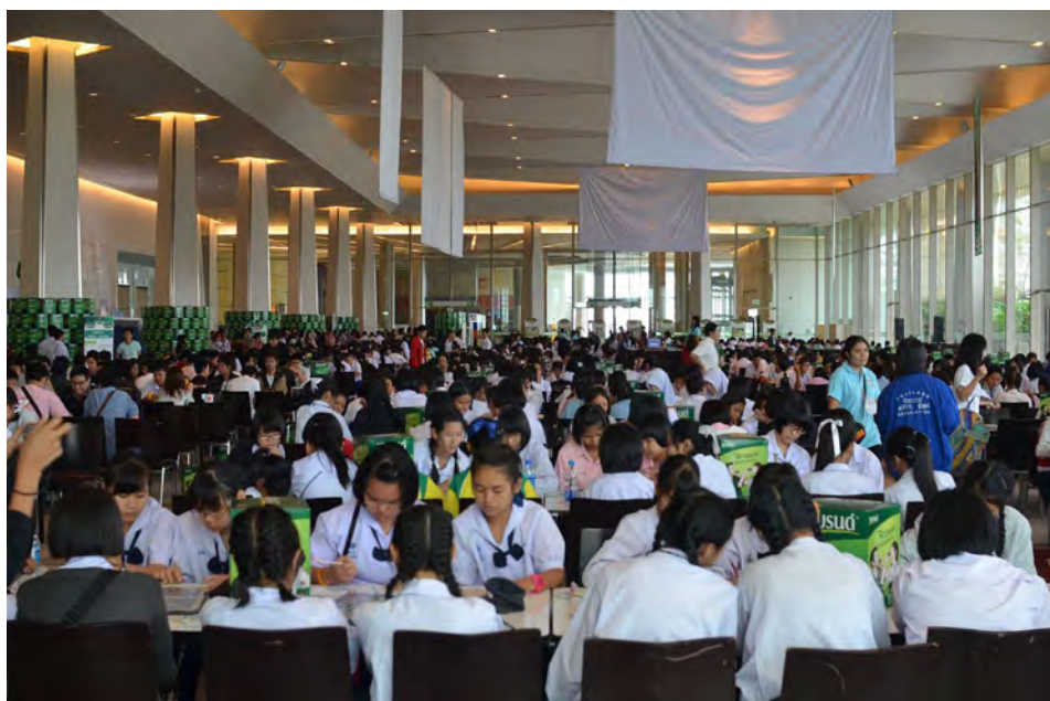
A view of about one third of the King's Cup playing area

So, in this case, the illegal play's tiles (6 tiles) PLUS any replacement tiles (6 tiles) are mixed and the overdraw rule is observed.